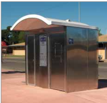
Katherine Town Centre

Katherine installed their first Exeloo in March this year in the CBD providing a safe and hygienic toilet facility to visitors and locals. The installation proves that Exeloo installations, which are highly visible, blend in well with the street scape and more importantly help to reduce vandalism and anti social behaviour associated with public toilets.