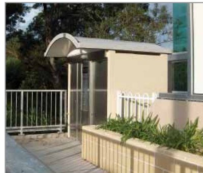
Carlton Railway Station