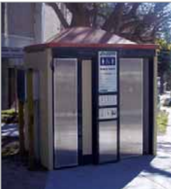
Sydney Road, Seaforth

Public Toilets should be located in a highly visible and well frequented location ensuring maximum active surveillance. Misuse of Public Toilets is greater away from active areas. The public feels safer at locations that are visible and where there is constant activity.