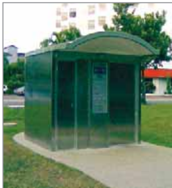
The Esplanade, Darwin

Other considerations are external lighting, landscaping and others. Please ask us for advice when planning your next public toilet project.