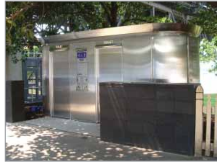
Bradfield Plaza, North Sydney

We have considerable experience with over 400 Exeloo installations throughout Australia. Our approach to public toilet design is confirmed through findings by The National Crime Prevention, The City of Melbourne, The American Rest Room Society and many other overseas authorities involved in managing or designing public toilet facilities.