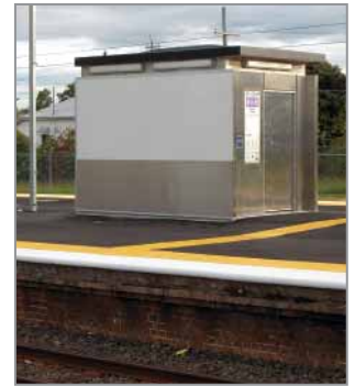
Exeloo Titan Wynnum Station

Queensland Rail has installed an Exeloo Titan on the platform of Wynnum Station, Brisbane. They choose Exeloo for the same reasons as Local Government Authorities throughout Australia. To provide a safe and hygienic toilet facility, which does not discriminate against the disabled and resists vandalism and loitering.