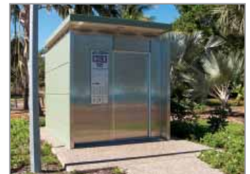
Exeloo Titan Darwin Sunset Park