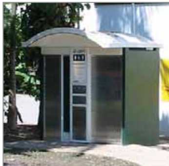
Exeloo Port Douglas